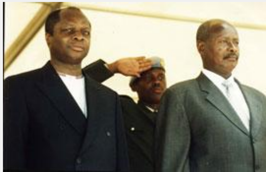
Kabaka Mutebi (L) and President Museveni

President Museveni's fear of a financially powerful Buganda monarch was responsible for the failed bid by a company in which Kabaka Ronald Mutebi II has interest to build 1,000 housing units near Kampala, it has emerged.